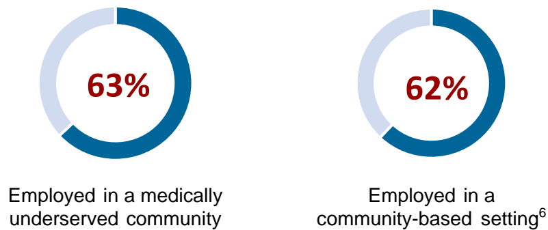
Figure 2. CHWTP Employment Settings, AY 2022-2023 (N=715)

Note. Categories are not mutually exclusive and may sum to more than 100%.